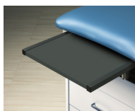
Pull-out, slate, laminate, leg rest