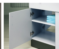
Both Sides Access