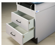
2 drawer storage