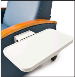
Optional Side Table is mounted to left side of recliner and can be folded down when not being used.