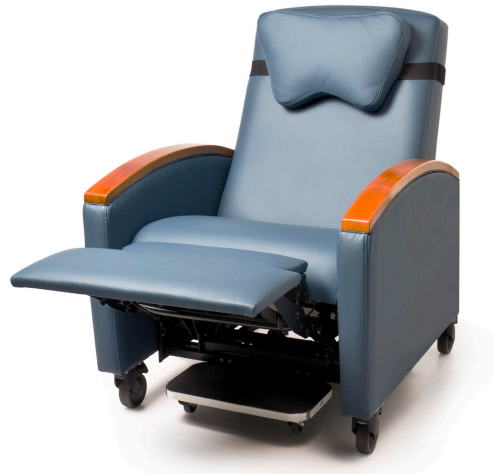
Ortho-Biotic™ II Recliner with wood trimmed arms