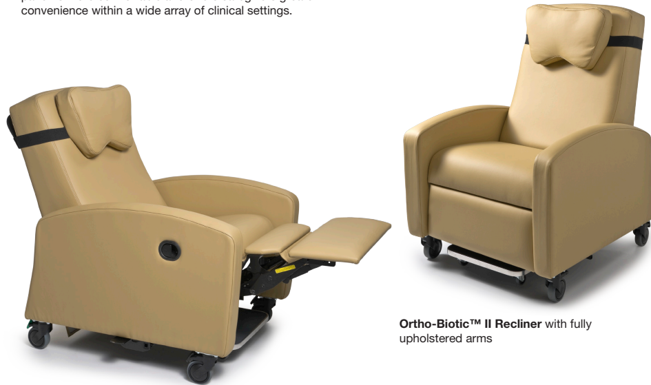
Ortho-Biotic™ II Recliner with fully upholstered arms