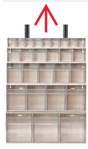
Utilize rails when base of the first bin will sit on the floor