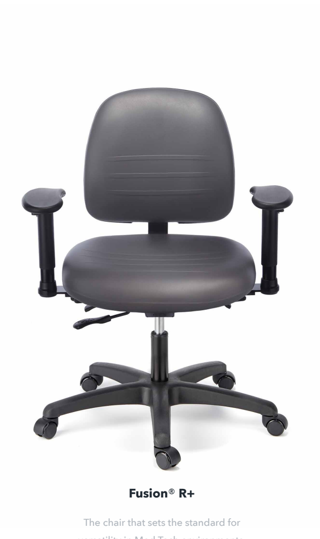
The chair that sets the standard for versatility in Med-Tech environments. Shown in Graphite.