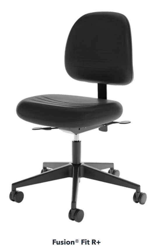
Slightly smaller footprint, same quality and proven performance. Shown in Black.