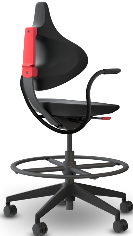
High height with arms.