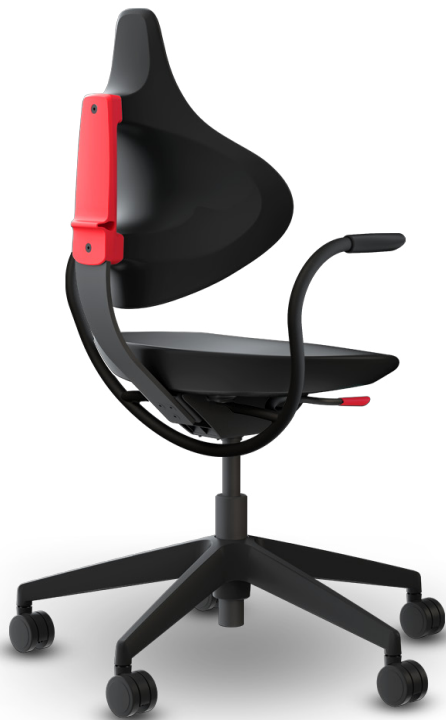
Desk height with arms.