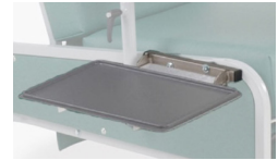
Flip-up Side Trays