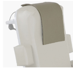
Matching Head Cover