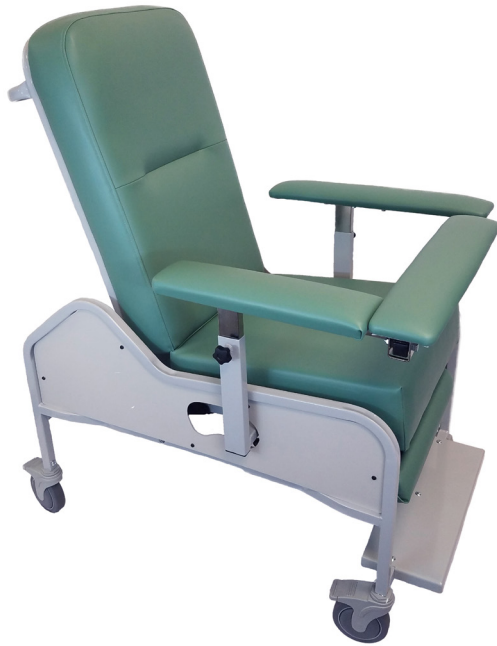
Traveling Arms Recliner Item# 2502M6